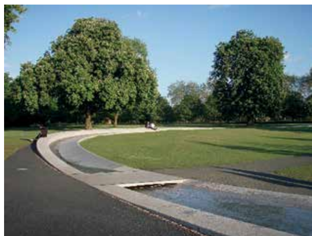
Il. 4. Badania dynamiki i statyki wody na przykładzie Memoriału Diany, Księżnej Walii, Londyn, UK, 2003–2004.