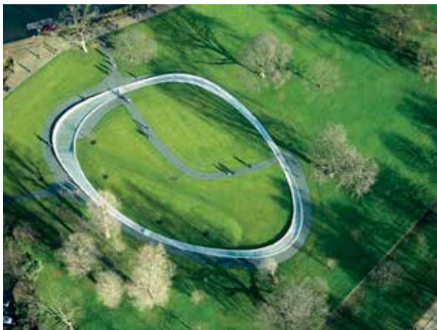
Il. 3 Memoriał Diany, Księżnej Walii, Londyn, UK, 2003–2004.