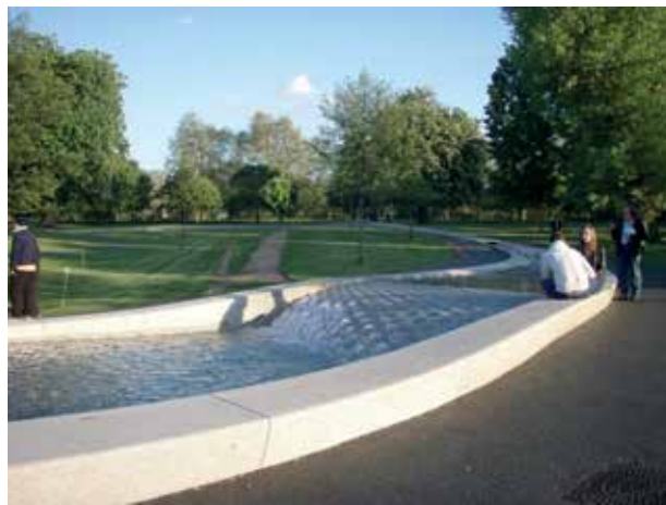
Ill. 3 The Diana, Princess of Wales Memorial Fountain, London, UK, 2003–2004.

sobriety, and perseverance. The water mirrors symbolize life, purity, peace, and the immaterial. Grass symbolizes tenderness and compassion. The jacaranda trees symbolize joy, sorrow, hope, and through their cycle of birth and death, life's constant renewal.” 4