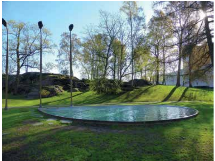
Il. 1. Memoriał fińskiego prezydenta Urho Kekkonen, Helsinki, Finlandia, 2000.