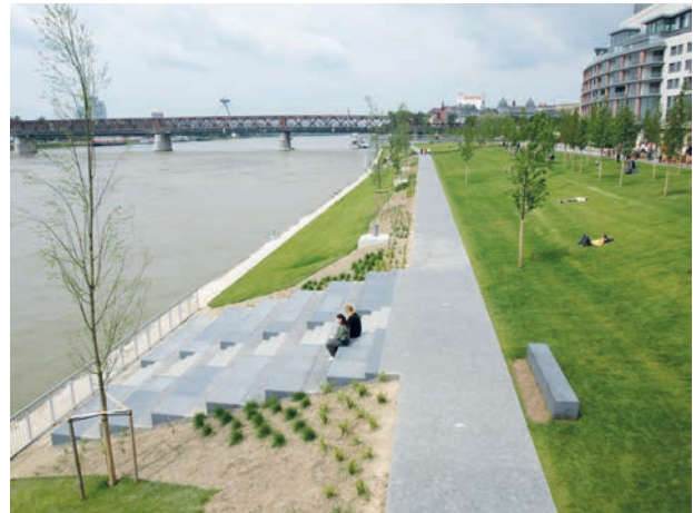
Ill. 4. Green Danube embankment of Eurovea.

development and redevelopment, only small scale concepts of public green spaces are found. Zonal plans for development of the Danube embankment in Petržalka between the bridges 3 , or Zonal plans for development of the embankment under Bratislava castle 4 , both propose strips of green spaces complementing built up structures. Although small urban parks or small scale green areas are important components of urban structure, too. For example, in a recent redevelopment of the Danube embankment, one of the successful examples of a green promenade and recreational green spaces – Eurovea 5 (Ill. 4).