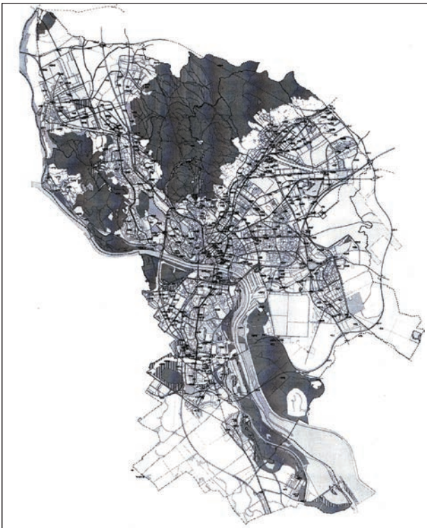
Ill. 3. Green network (dark grey) in the spatial plan of Bratislava