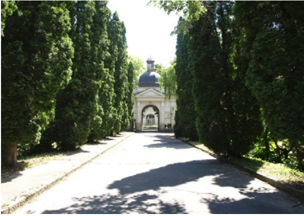
Il. 5. Evergreen tree-lined entrance path