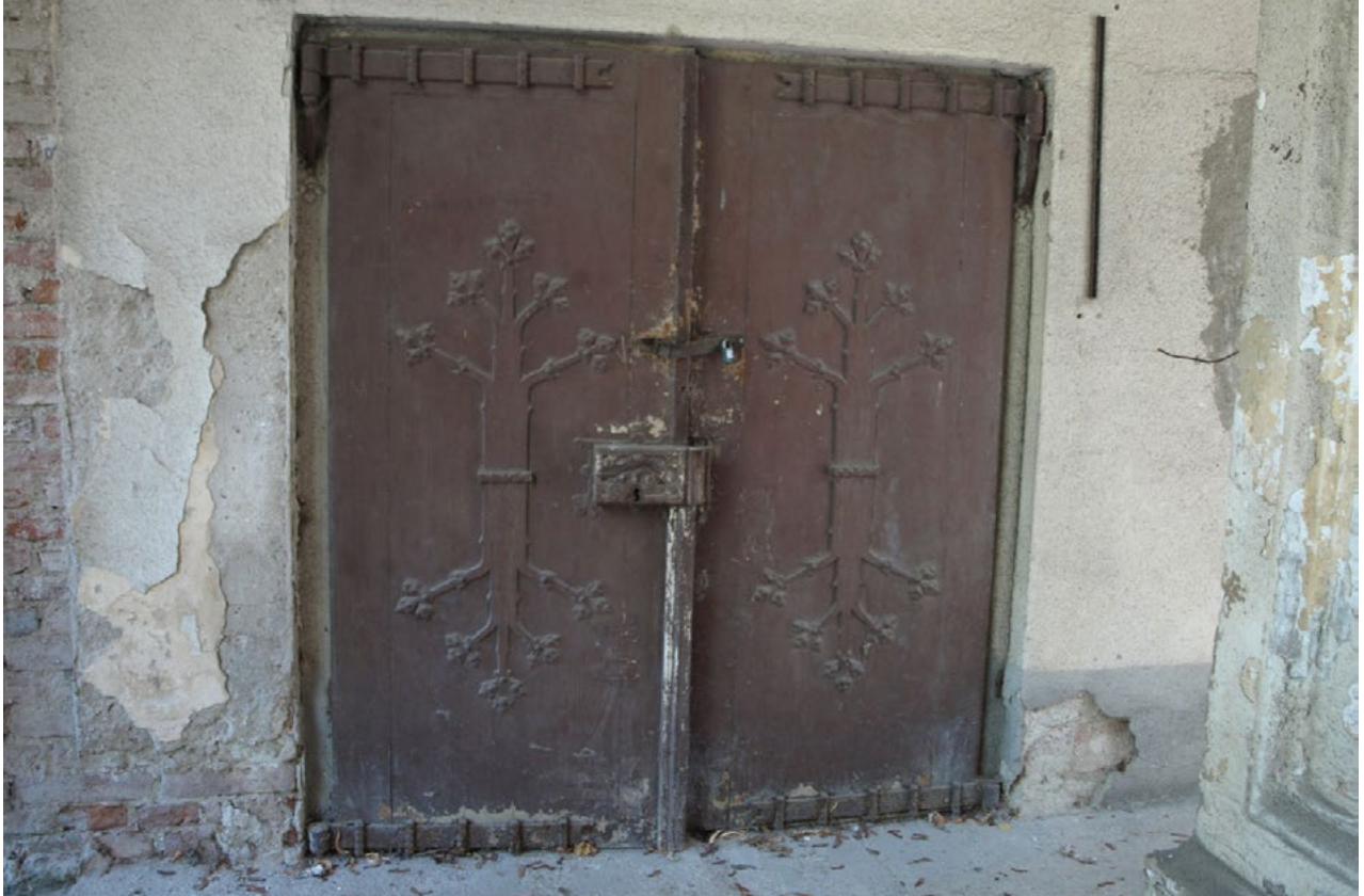
Il. 3. The wooden door to the chapel ornamented by the motif of Tree of Life