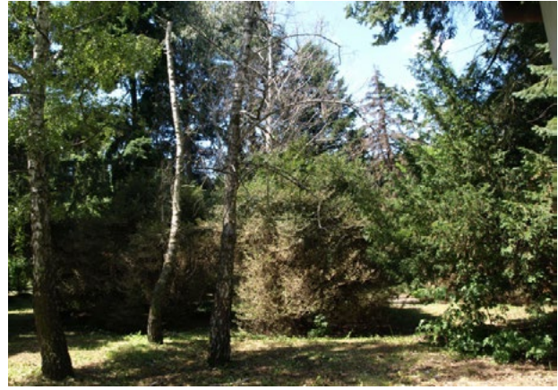
Il. 6. Lack of care and maintenance left footprints in the hospital park