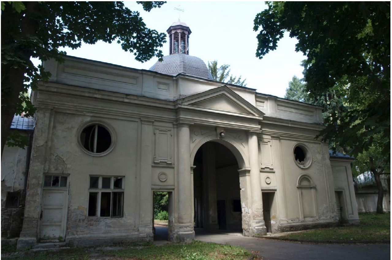
Il. 2. The entrance building with the chapel and the passageway