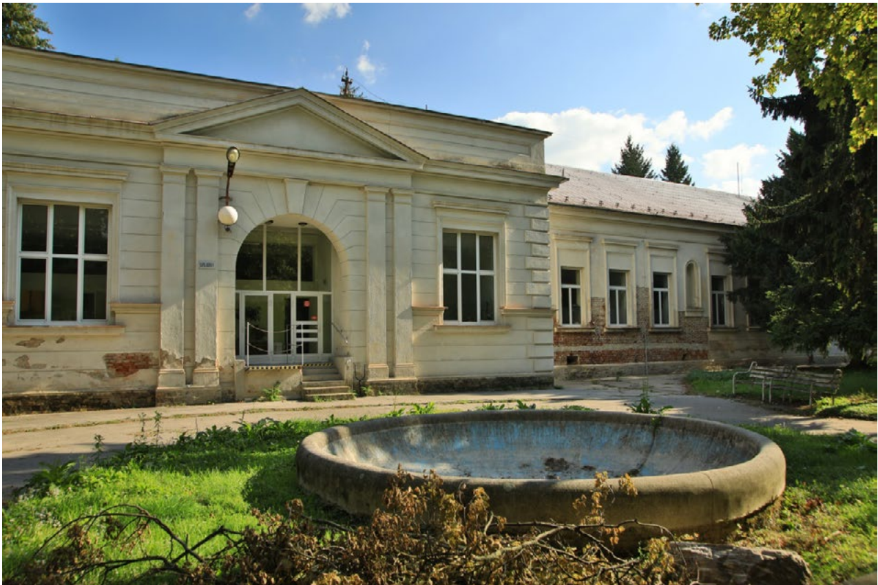
II. 4. The round shape of water basin – fountain in the middle of the hospital courtyard